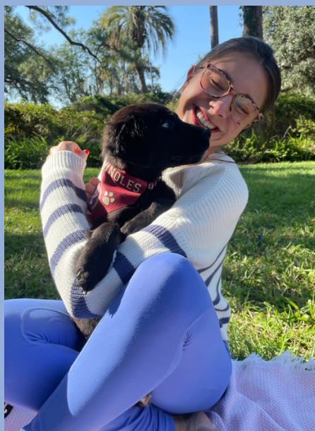
FSU student cuddling Hutch

of green, Landis, we sat with the puppies and let them roam around and introduce themselves to anyone that passed (which was a lot of people). Both puppies have been adopted since this event, which is the case for many of the dogs that are involved in this easy, yet effective event.