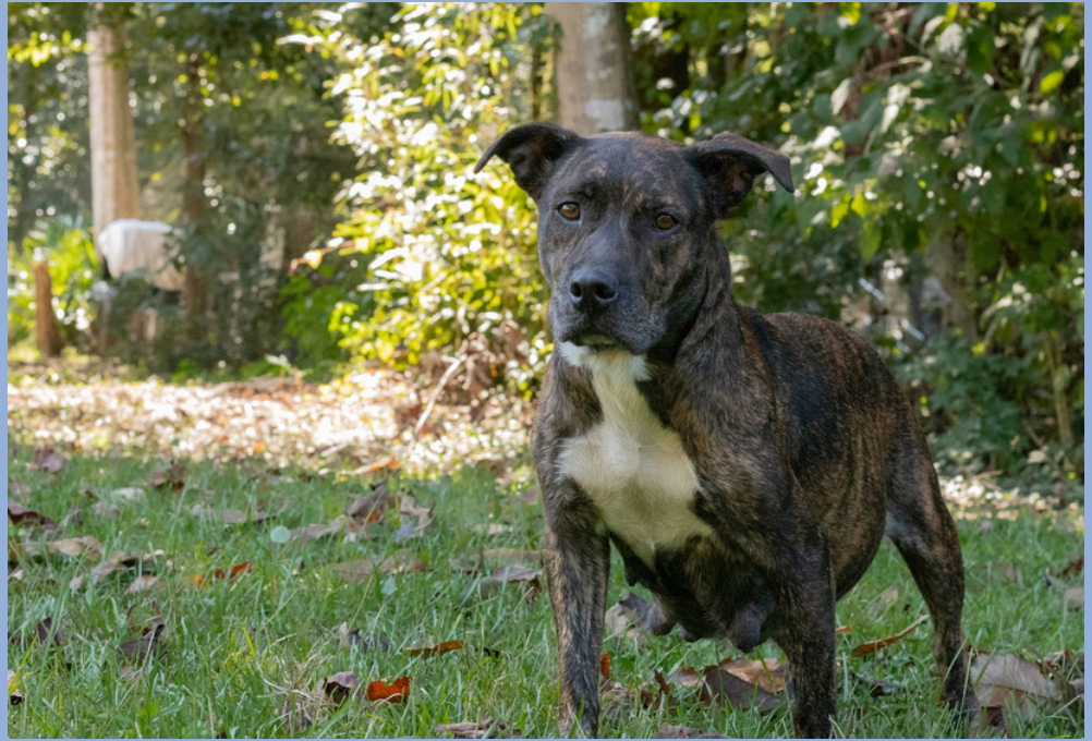
Fancy the momma

Nunez runs the social media for the rescue along with setting up meet and greets for potential adoptions or fosters.