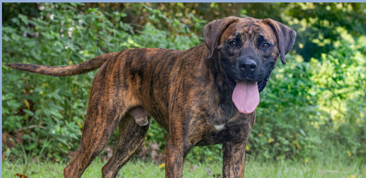
Siegfried posing perfectly for the camera

"The rescue continues to grow more and more in order to help save more pup's lives!" -Nunez