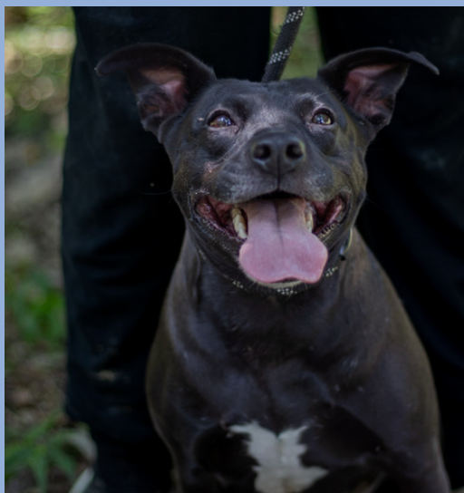
Polly the happy puppy